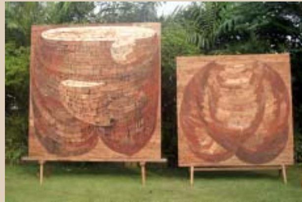
Amata Art Award, 1st prize