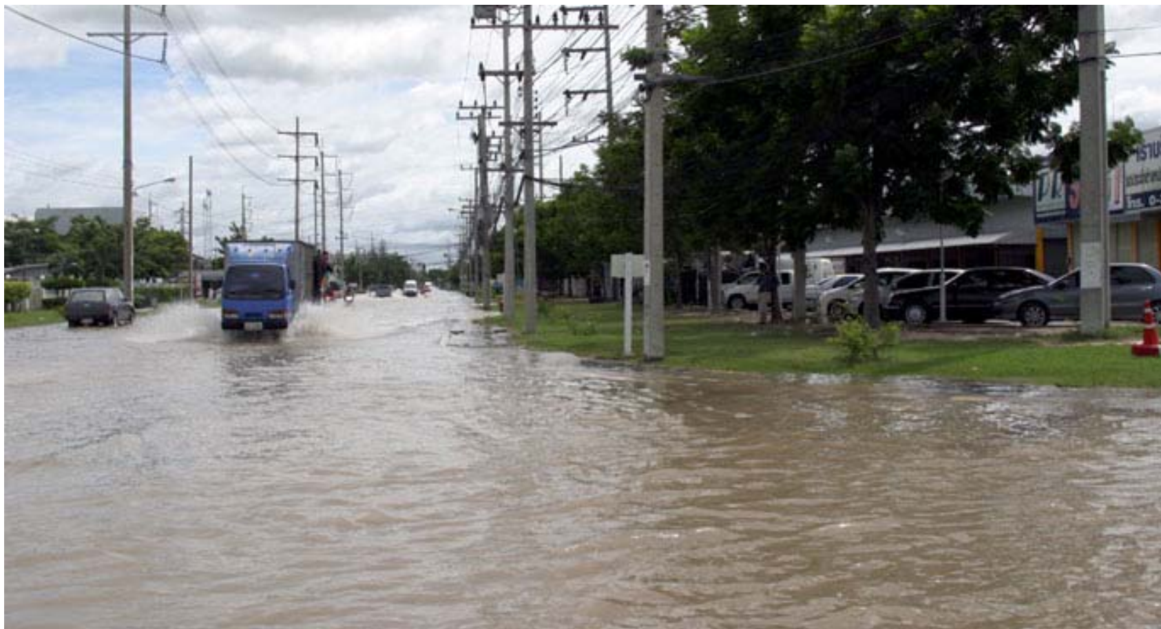
Flooded road at the industrial estate.