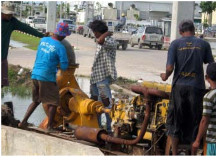
Pumps are used at the industrial estate to ease the traffic problem.