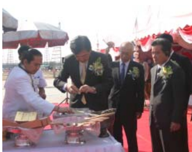
Stone laying ceremony at Toyota site.

The 100+ rai project will help Amata's bottom line but STM benefits from mul-