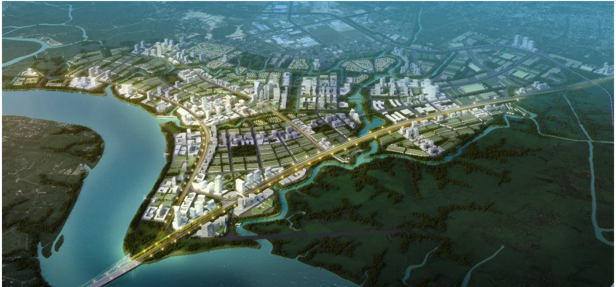
(3D design of Amata projects in Long Thanh district.)

Despite the current global economic challenges, Amata City Long Thanh Industrial Park still attracts significant Foreign Direct Investment attention, especially from enterprises that need to rent land to build factories. Amata confidently support your business with a professional team and the highest level of service.